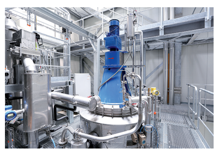
Fig. 2: The strength of short path distillation is that it is gentle on unsaturated fatty acids and yet provides effective purification.

Refining processes that work well for other vegetable oils operate at temperatures of 180–250 °C. As this would be an excessive thermal load for omega-3 oils, Nutriswiss has established a system to both maximise the yield and minimise the level of contaminants. At the centre of this technique is short path distillation (SPD), a particularly gentle physical separation process that is already well-established in the fish oil industry (Fig.2). Equipped with additional process technology, it is the procedure of choice for difficult-to-process raw materials, those that are heavily contaminated or when an extremely pure end product is required (baby food, for example). With the help of a finely controlled vacuum (with a pressure of less than 0.01 mbar) and short residence times, the thermal load on the product is significantly